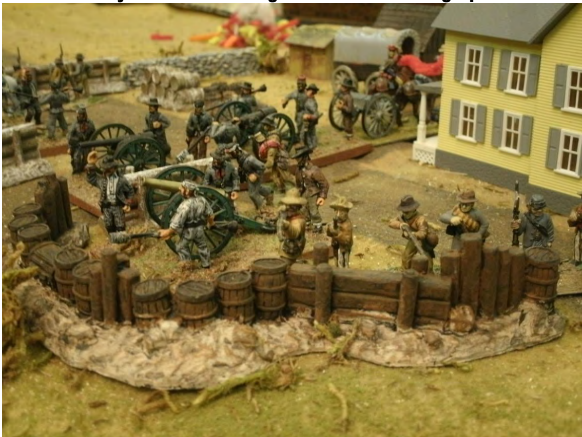
There Were Many Theme Games-Almost 150 Years Since Appomattox