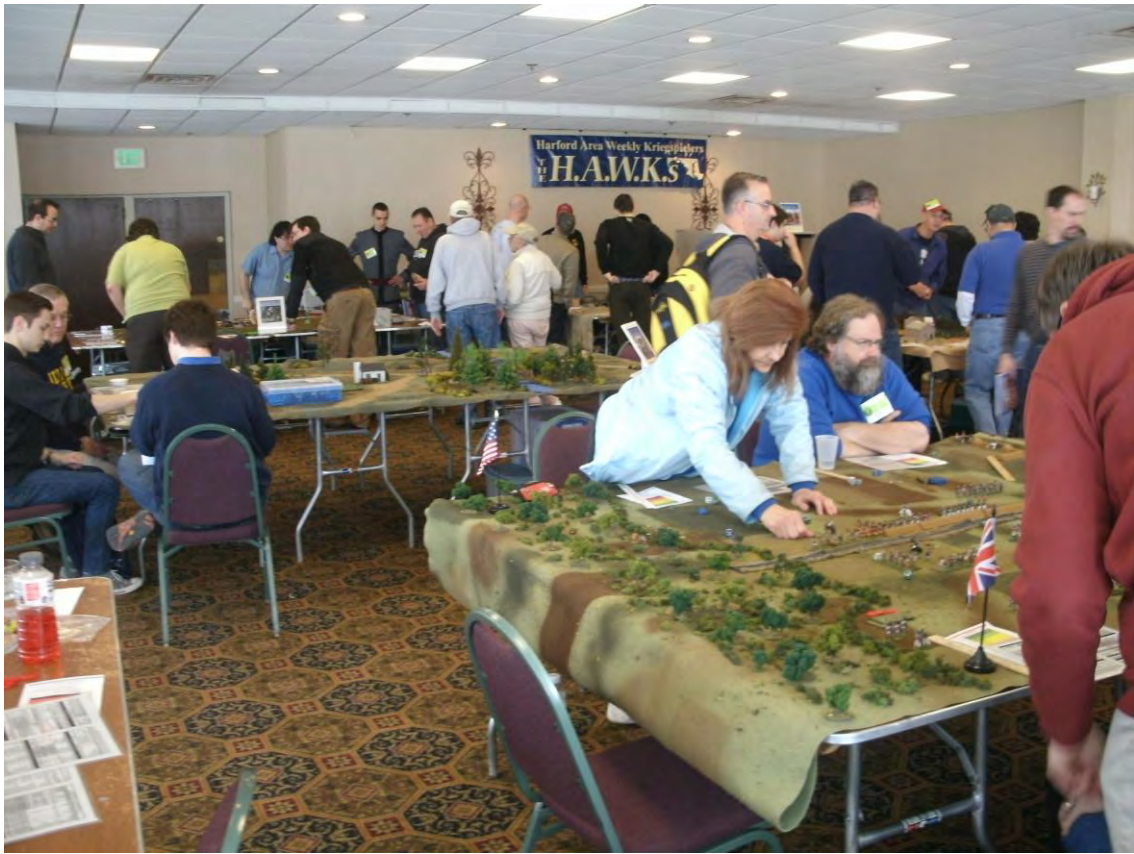
Coming Up The Harford Area Weekly Kriegspielers Also Had A Full House