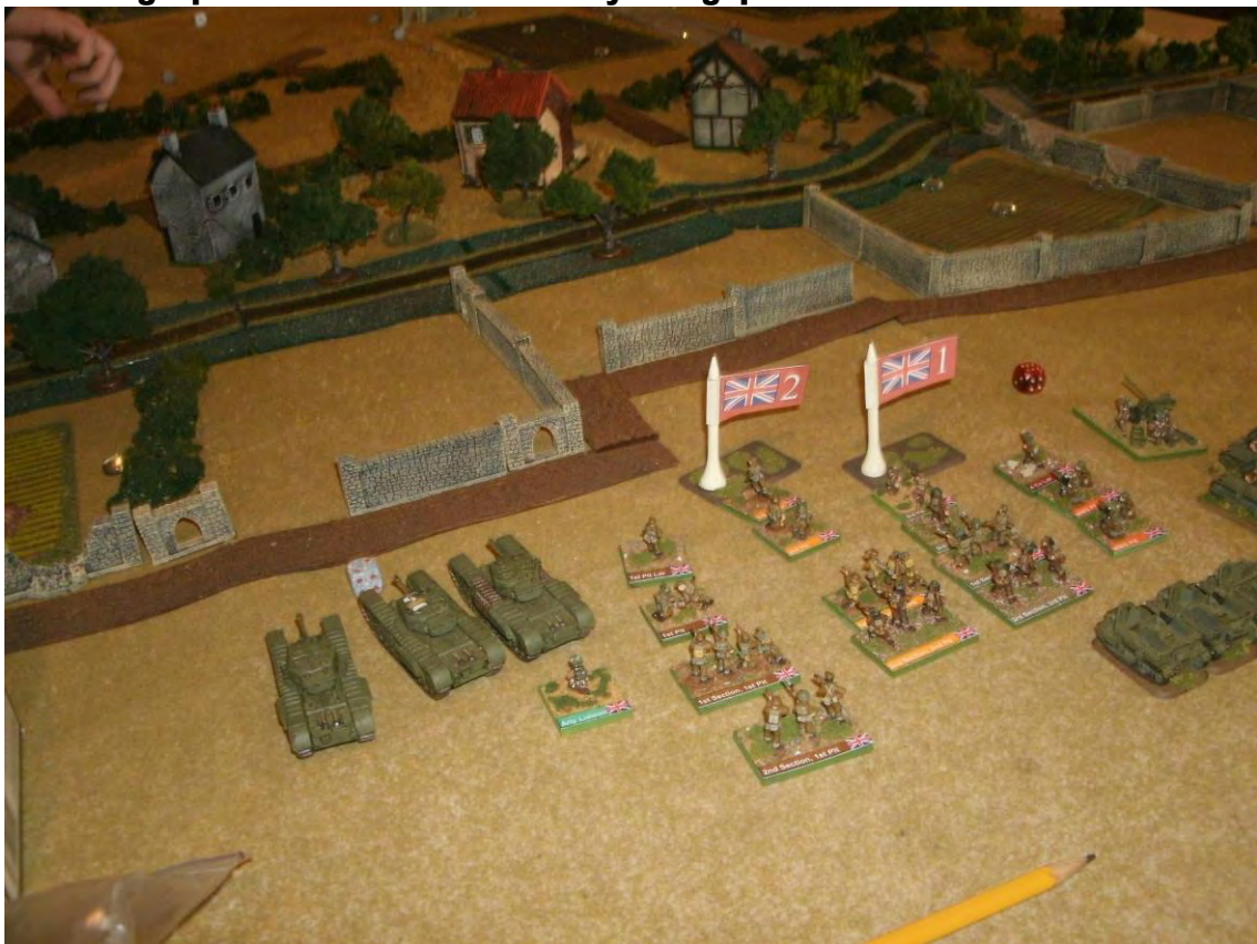
Including A Bit Of WWII-Less Prevalent Than Usual