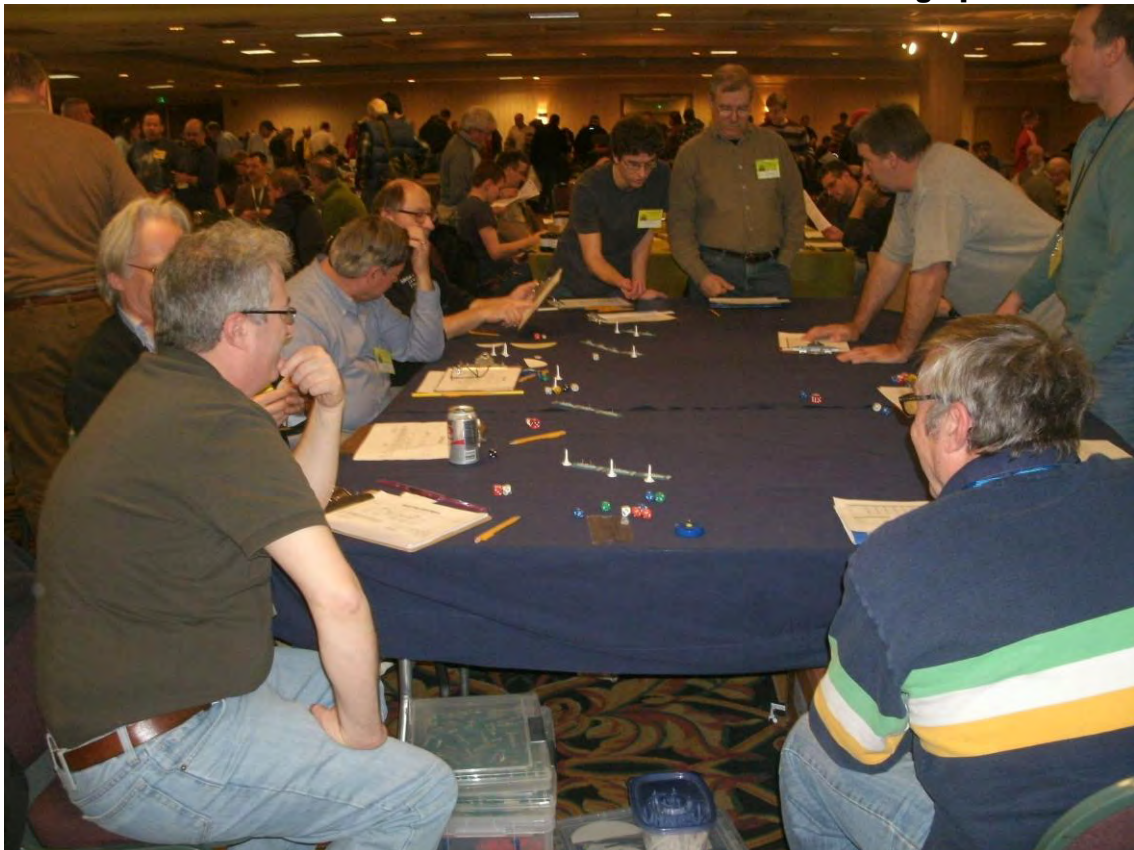
And The Distlefink Was Booming