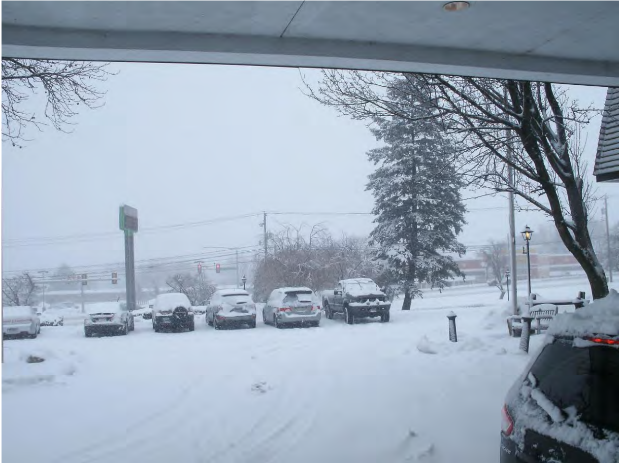
Looking Out The Front Door of The Lancaster Host 5 March 2015

I had planned to stop over on the night of the 4 th in the DC suburbs before finishing the trip to Lancaster for set up on the 5 th . Fortunately I was warned by family members that I had better keep going. A major winter storm was coming in, and the increasingly heavy rain was to turn to snow overnight. I mushed on through the rain and increasingly dismal Washington DC area traffic (what were all those idiots doing on the BW Parkway at 7pm Wednesday night?) Indeed I made it to the motel down the hill from the Host and settled in for a good night's sleep. And as promised, when I got up the next morning there was almost two feet of snow on the ground with more in the air. I was able to get down to the barn and unload, but had to wait until someone made tracks through a bottom of the hill route before I could mush out, park my car in the lot shown, and abandon it for a couple of days. Fortunately I had brought boots for trekking about the town.