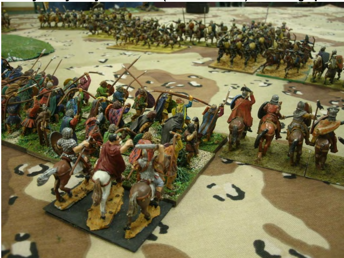
And The Ancients Corner