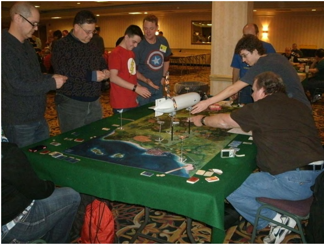
A Bit Of WWI Aviation