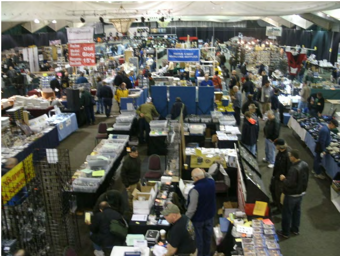
By The Next Morning (Saturday) The Shopping Crowd Was Up To Strength