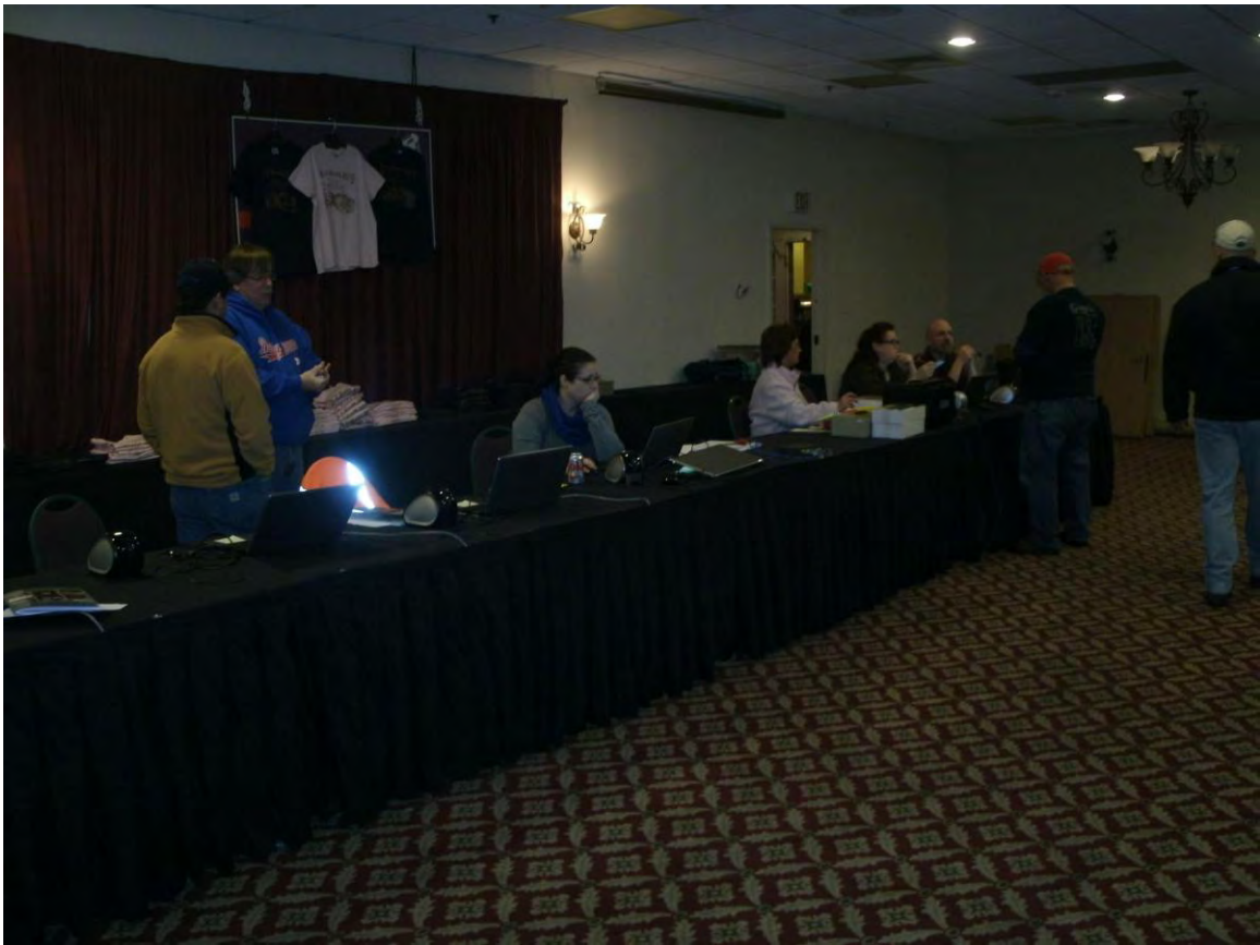
The Ever Alert Staff Were Set Up But Business Was Initially Slow