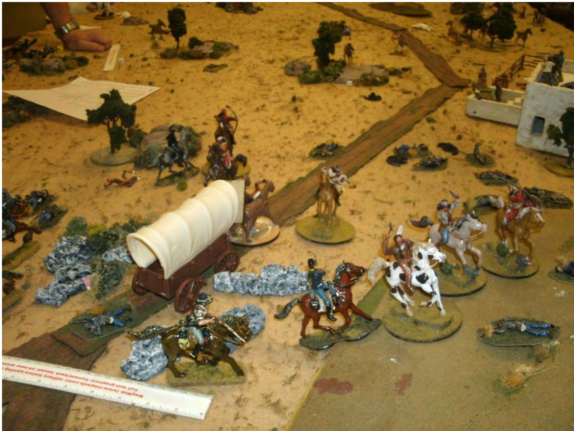
And There Were Even A Few “Native American Wars” Epics