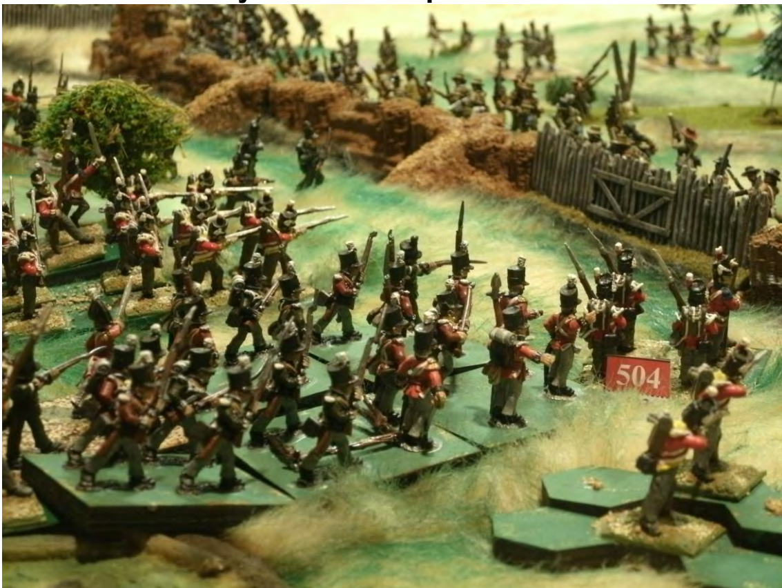
The Brits Wishing They Had Picked A Different Tour For Mardi-Gras