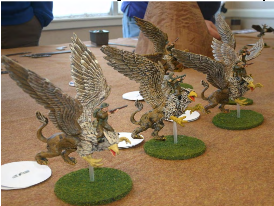
Colorful, But Hardly Historical