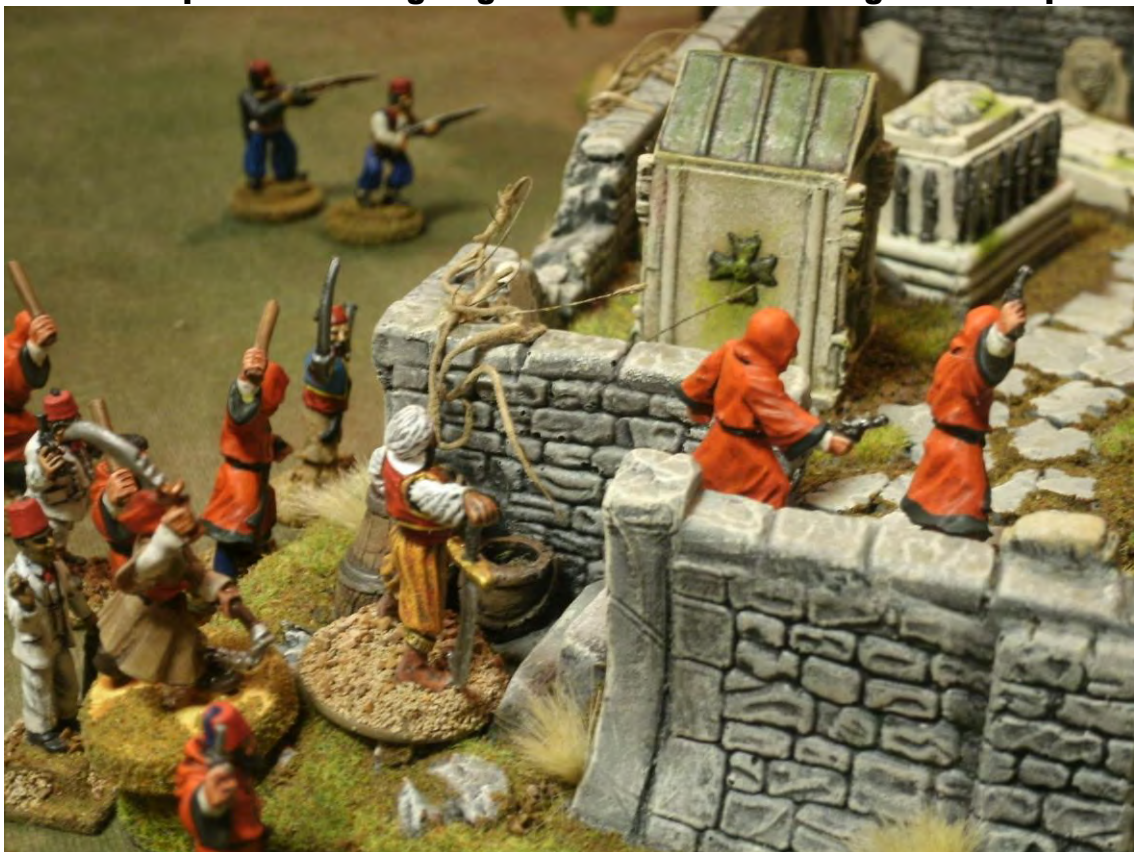
The Vendetta Is Headed By A Cult-I Prefer the Vampires