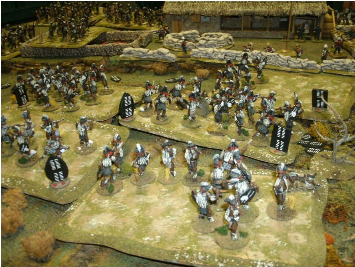
There Is Always Room For Rourke's Drift