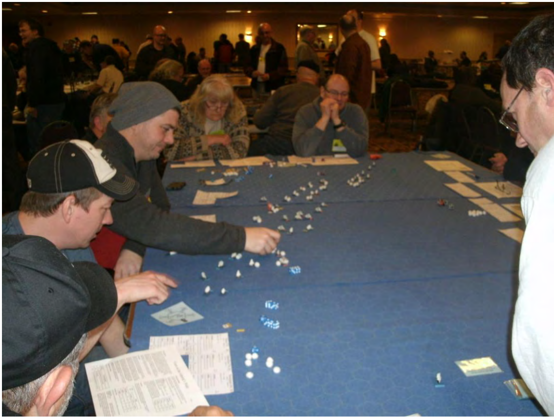
The Age Of Sail Is Represented In The Crowded Distlefink