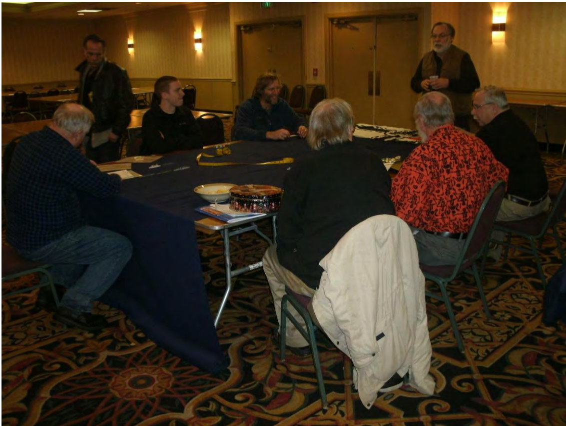
A Naval War Broke Out In The Distlefink