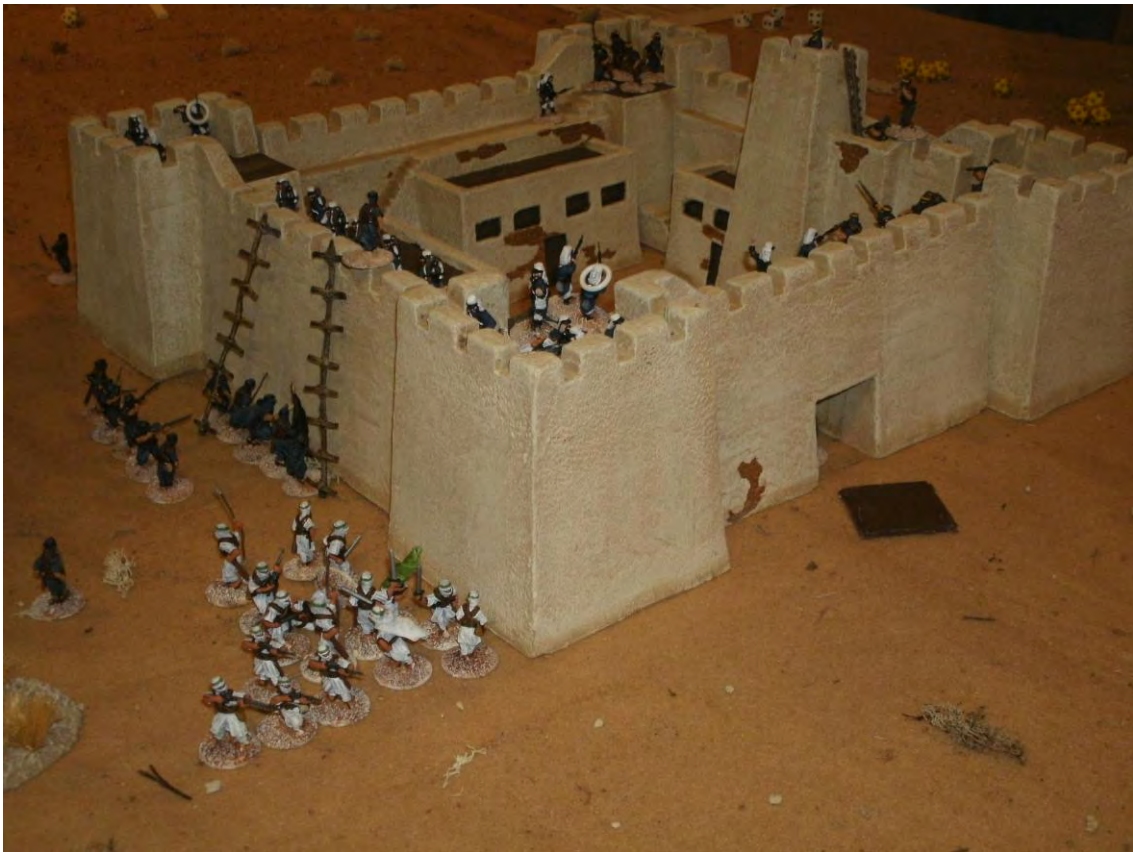
No Convention Is Quite Right Without A Touch of Beau Geste