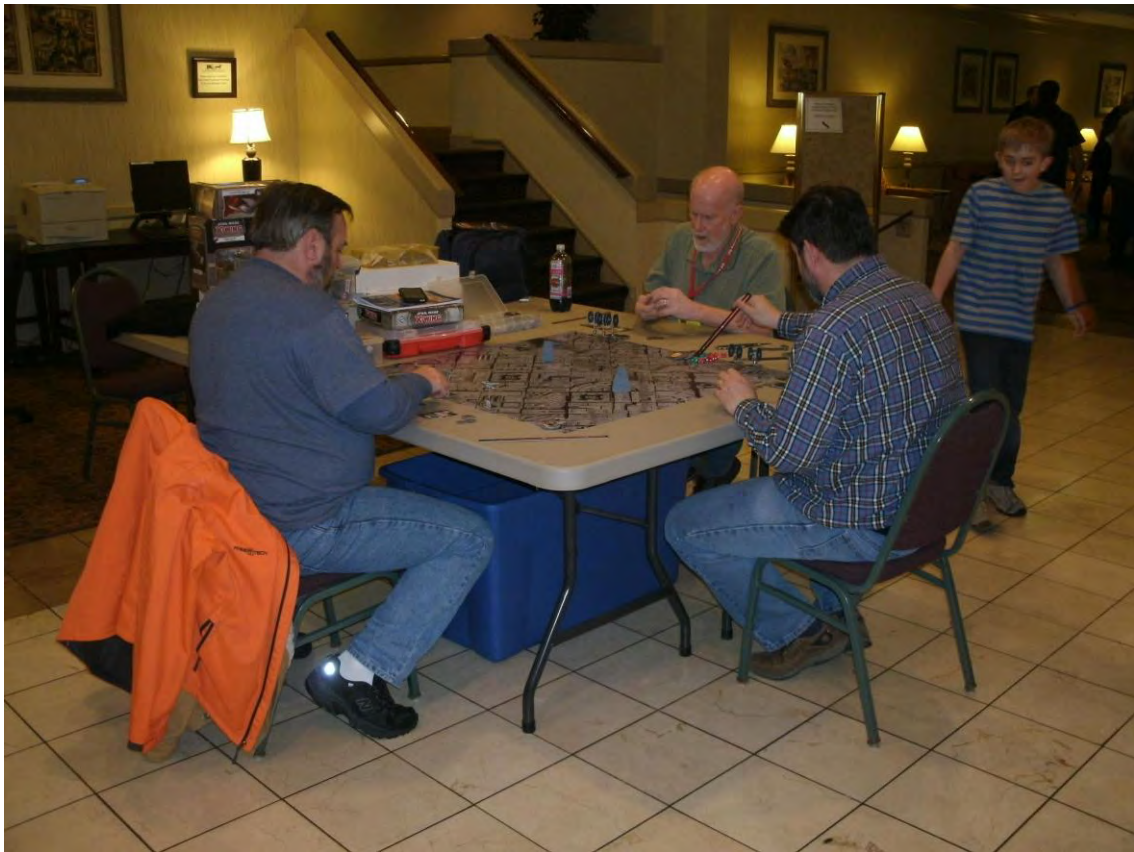
In Spite Of The Snow Games Picked Up Around The Host