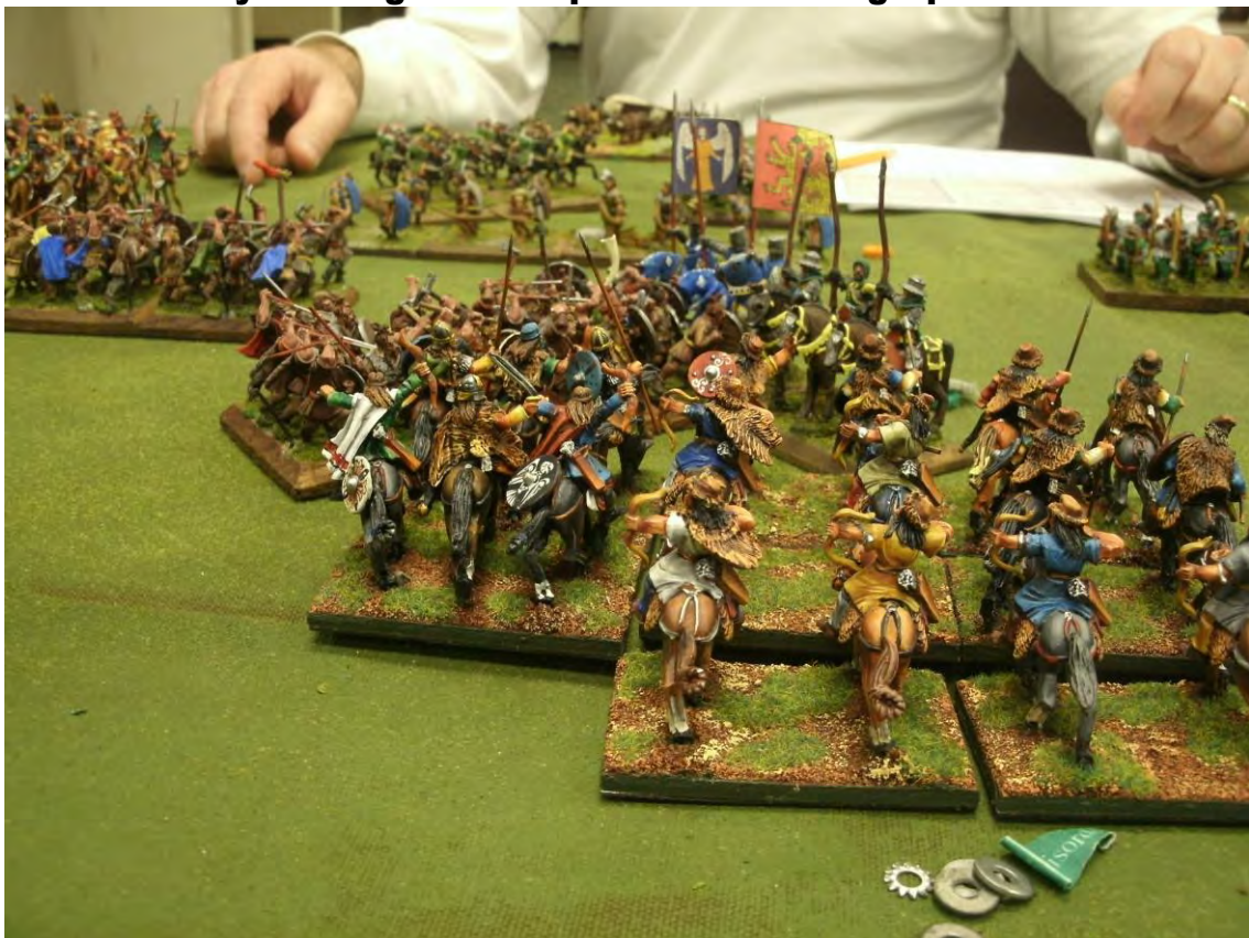
With The Usual Colorful Ancients Games