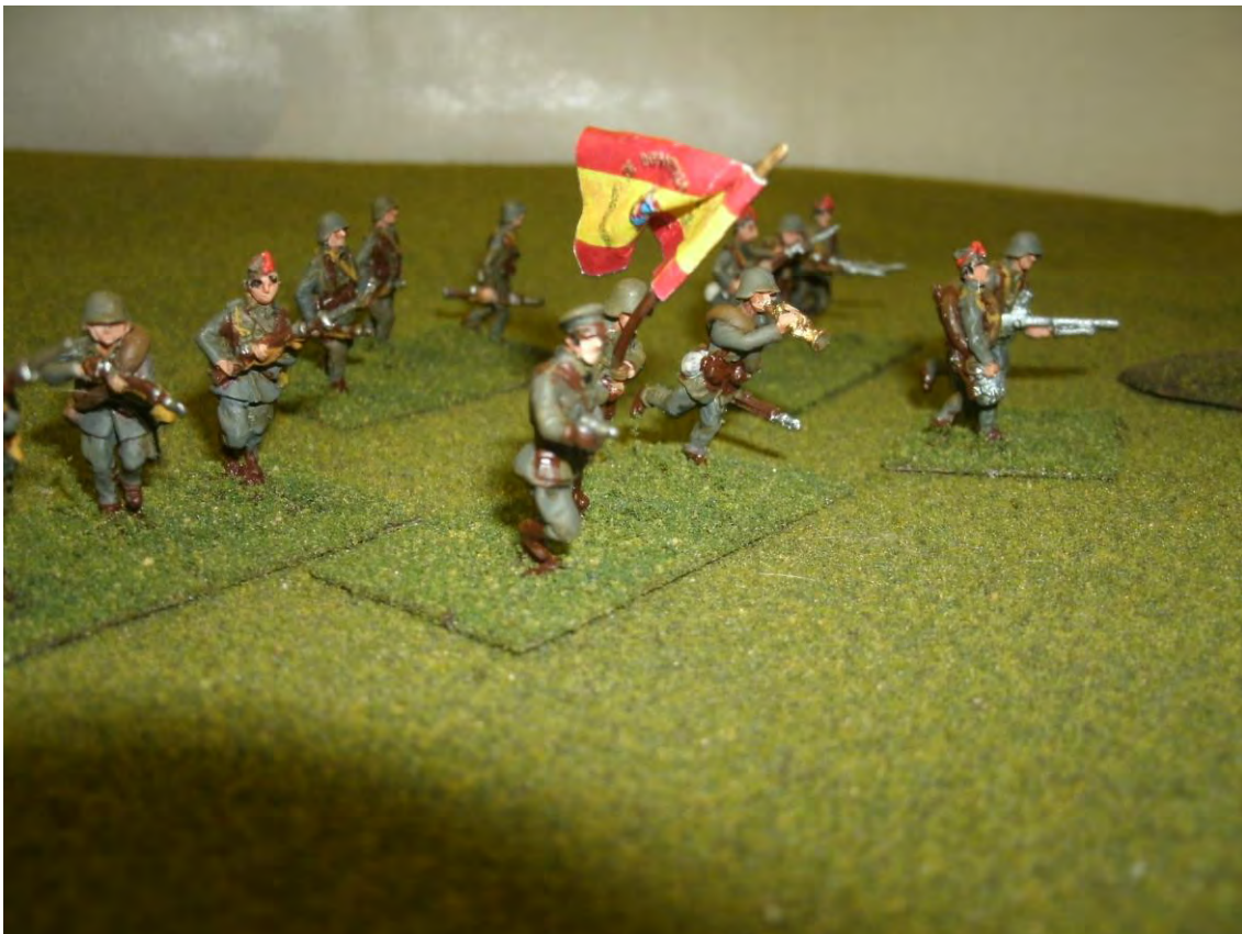
Next Time I Run A Game With Them

I did not search the Host for remnants Sunday. I packed up carefully and did my best to finish painting my latest Minairons figures. They are a challenge, but eventually I made some progress (see below.)