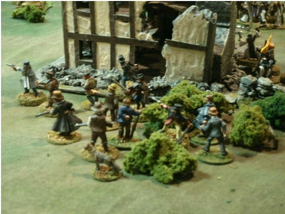
These People Are Getting Together For A Vendetta Against Vampires