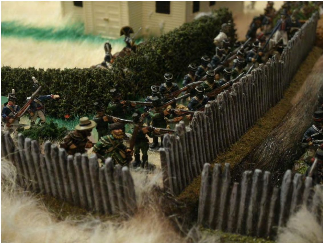
Elsewhere Andy Jackson's Troops Defended New Orleans