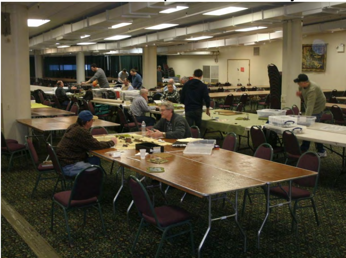
But Early On They Were Setting Up In The Lampeter