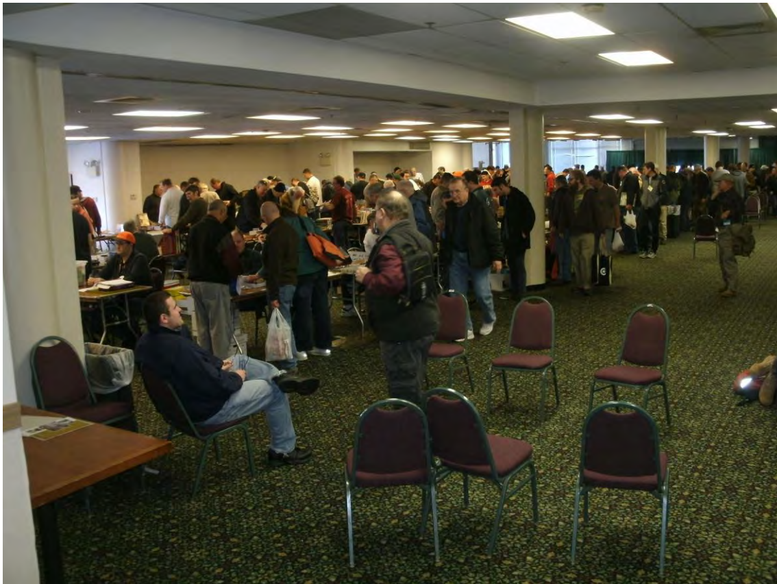
By Friday Wally's Basement (aka Flea Market) Was Filling Up