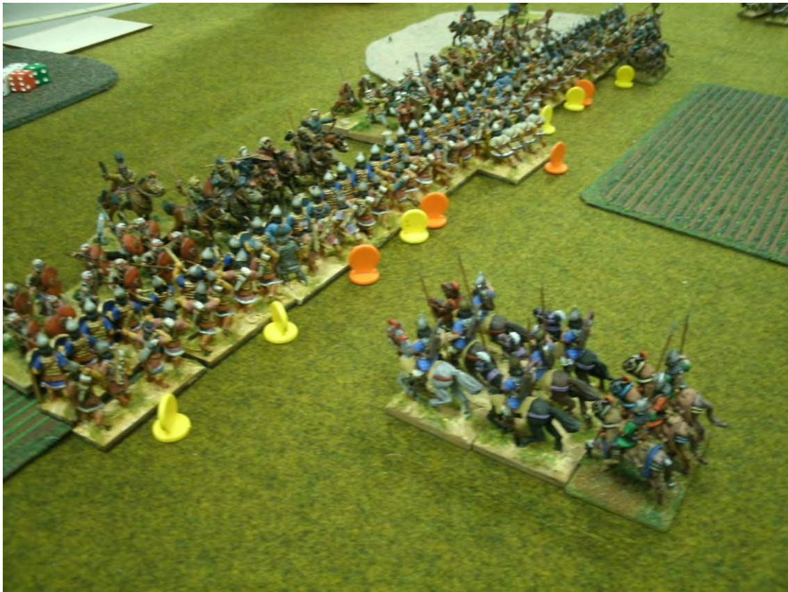
Already Some Of Those Colorful Ancients Games Were Under way