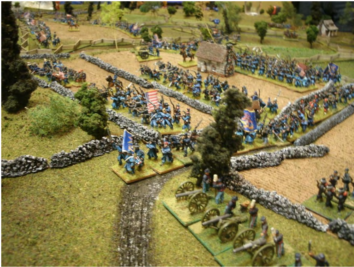
Of Course ACW Has Long Been A Favorite