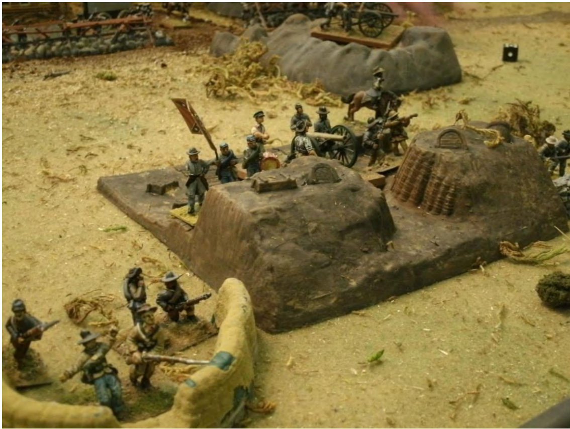
Old Men And Boys Man The Defenses