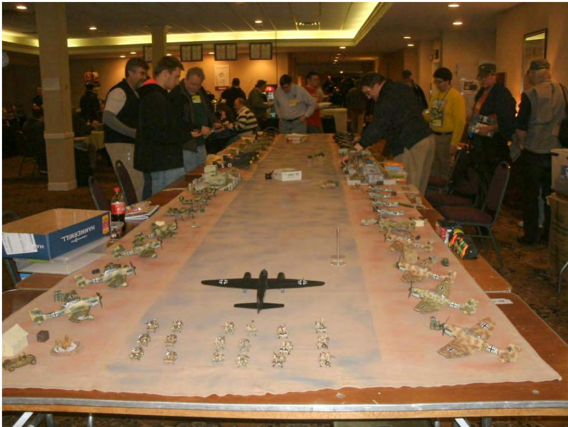
In The Distlefink Foyer The Long Range Desert Group Raids An Airfield