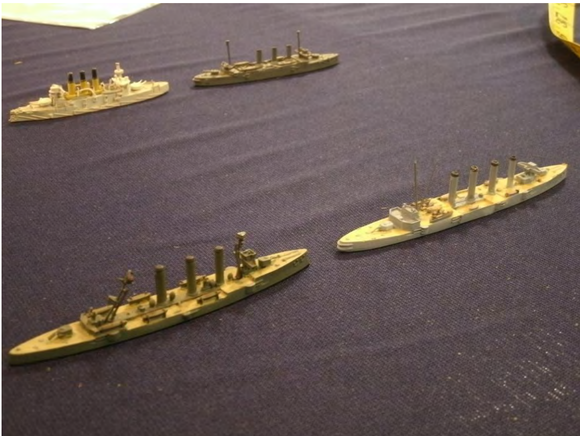
Featuring Ships You Could Actually See