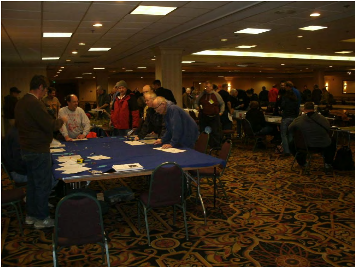
By The Next Morning Distlefink Was filling Up