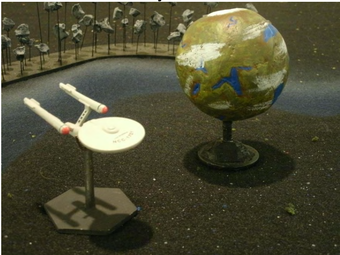
Meanwhile Sci-Fi Games Picked UP