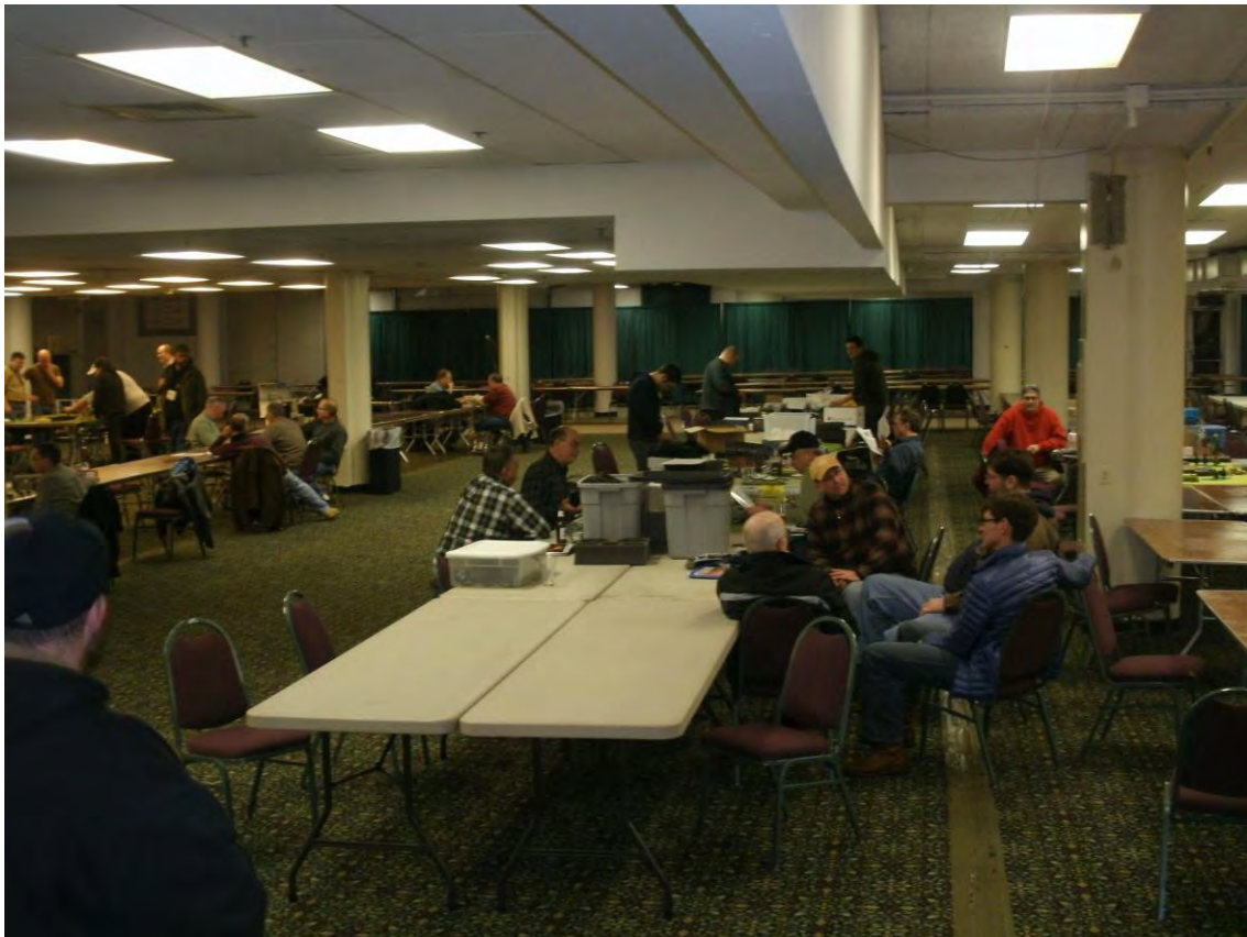
By Evening The Lampeter Was Picking Up A Bit