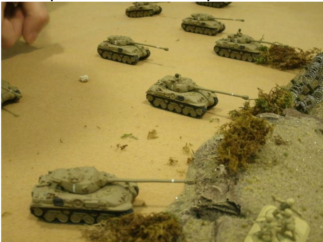
Super Shermans From An Arab-Israeli War