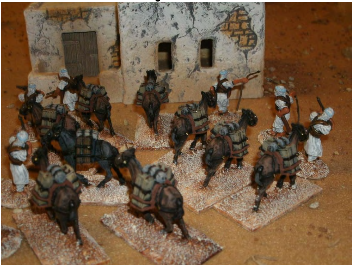
These Jihadis Seem To Have Captured The Supplies