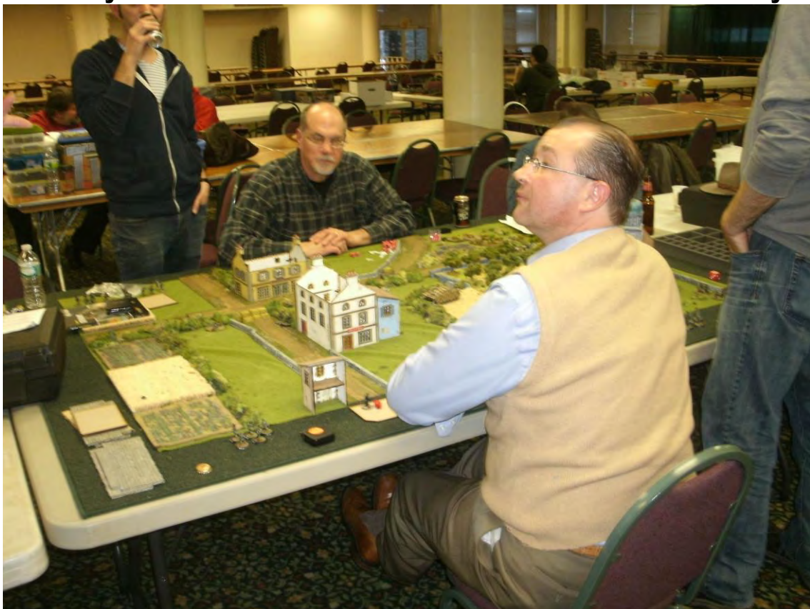
And Other Games Began To Trickle In