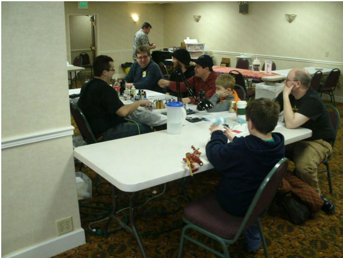
Upstairs Off The Foyer The Painting University Was In Full Swing