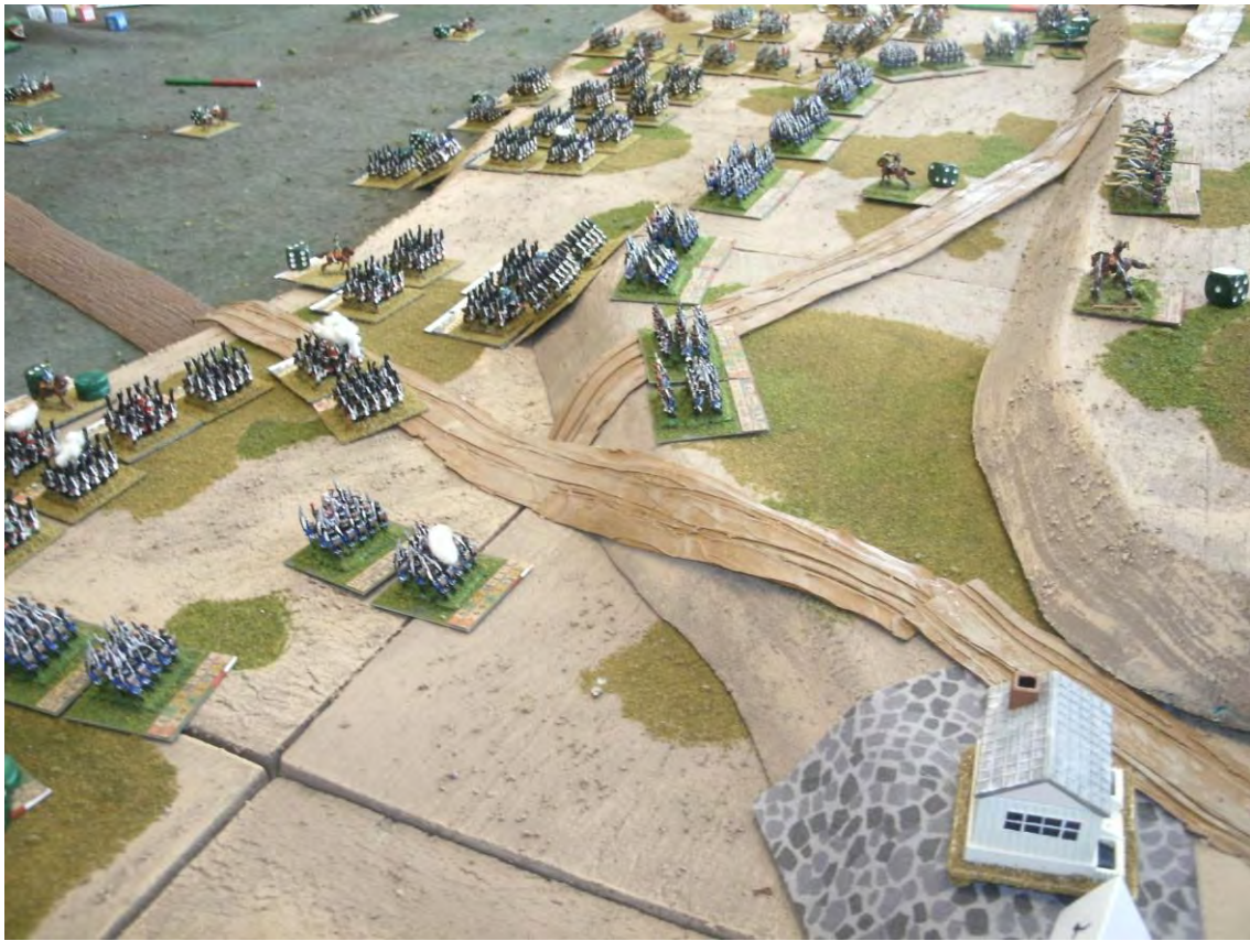
Napoleonic Battle Of Paris In 10mm