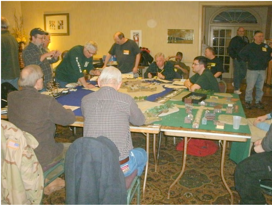
This Game Seems To Be About Naval Aspects Of The American Civil War