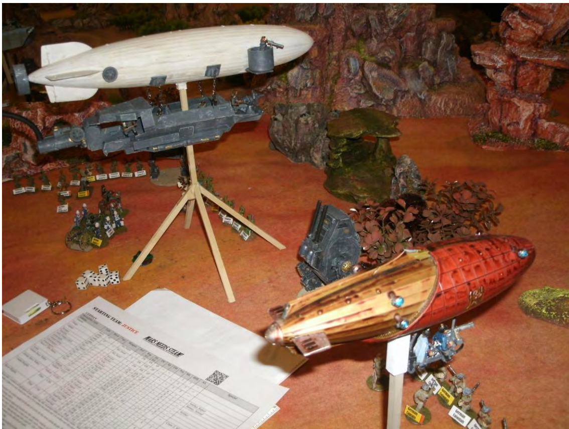
Not That Different From Earlier Models Used On Mars