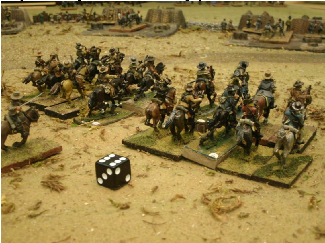
Forrest's Cavalry Support Defenders Against Wilson's Cavalry Corps