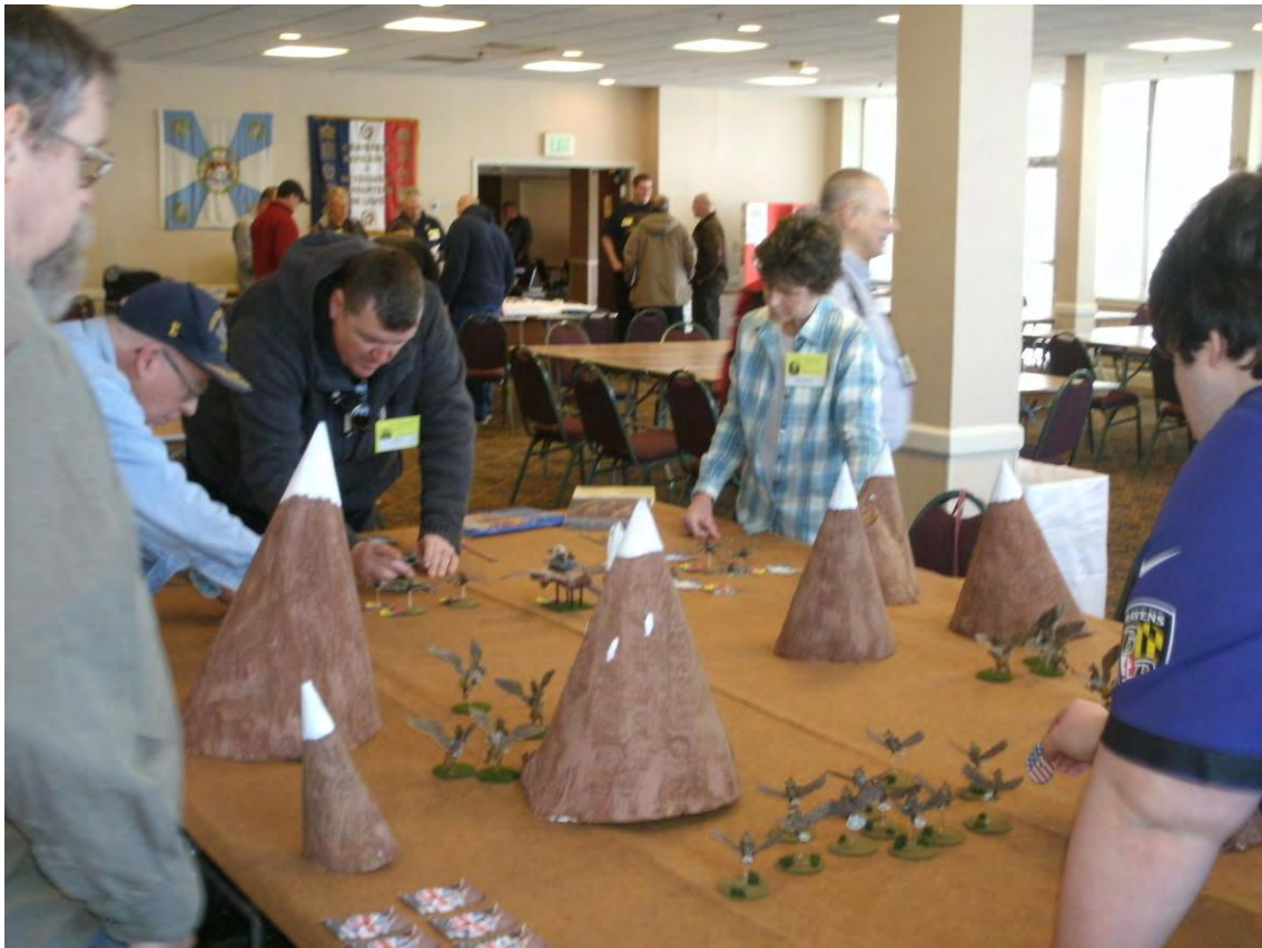
Somehow the Dark Side Emerges With WWII Griffons and Pterodactyls