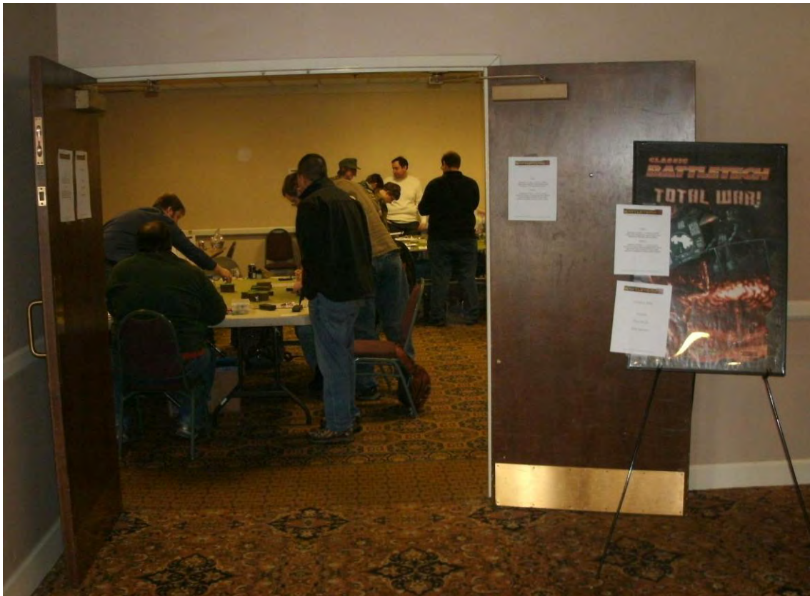
Next Door The BATTLETECH Bunch Were Also Filling up