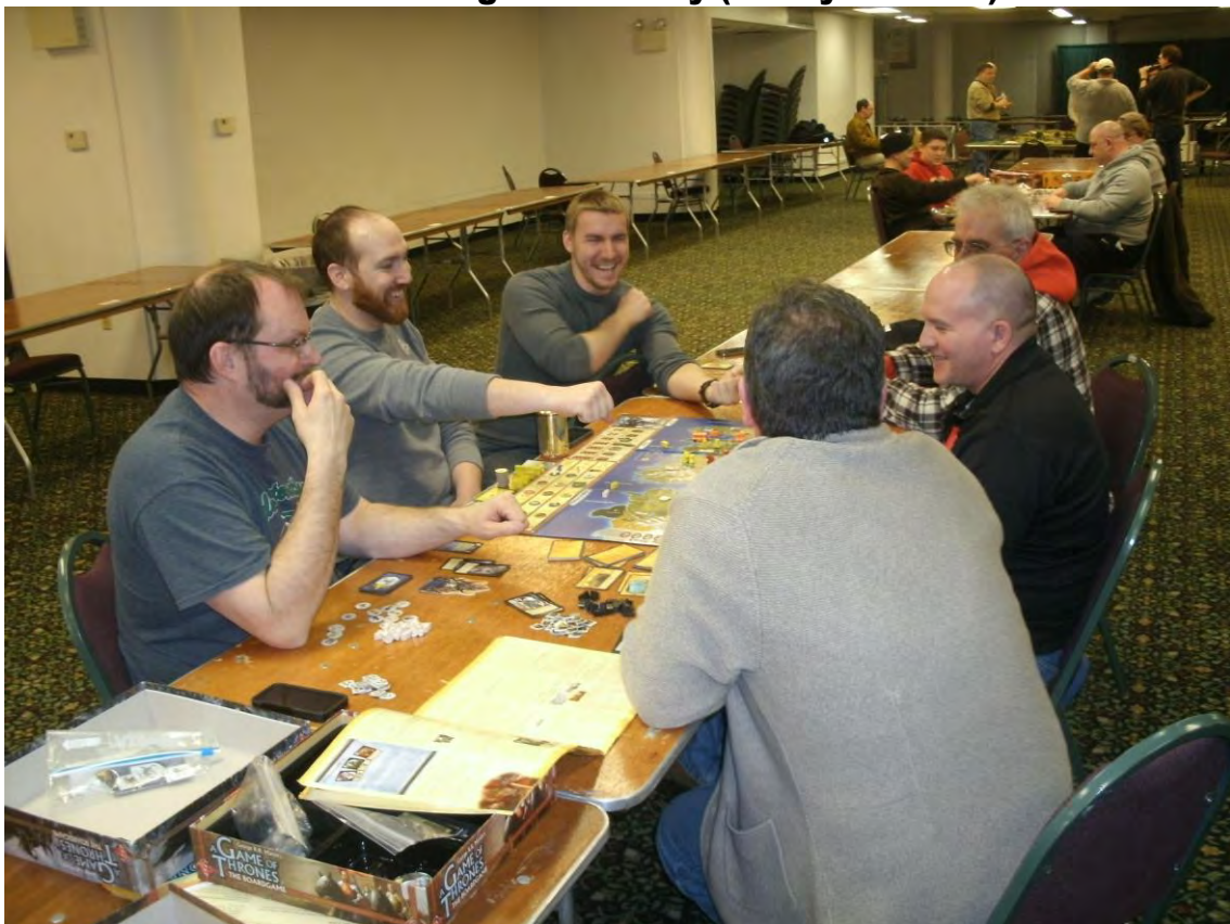
And The Game Of Thrones Drew Some Enthusiastic Tiddly Winkers